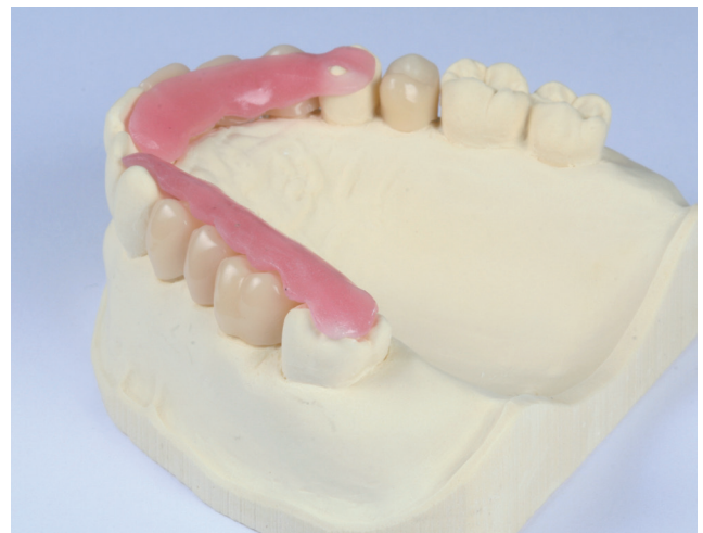
Model with "transfer key" in red acrylic.