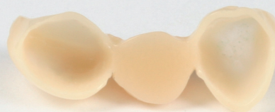
Temporaries from below

Thanks to the wafer-thin construction of the temporary, fitting it into the patient's mouth is made easy.