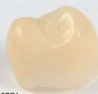
Side view of the temporary

If the temporary interferes with the occlusion, a permanent dental prosthesis with the necessary construction will not be possible, as well. For this reason, the temporary acts as a control for the dentist. It is possible to make minor corrections in the cervical area.