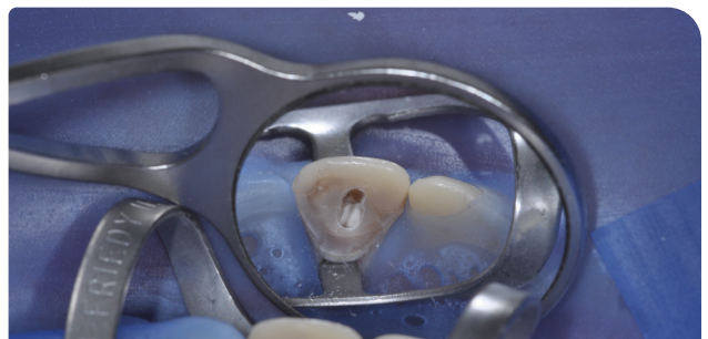
5 Application of a Harvard cement liner (1 mm).