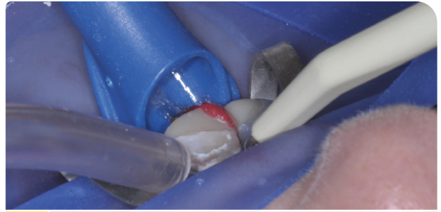
9 Flush out material with water and dry with a gentle stream of air.

Repeat this procedure up to three times to reach the desired result.