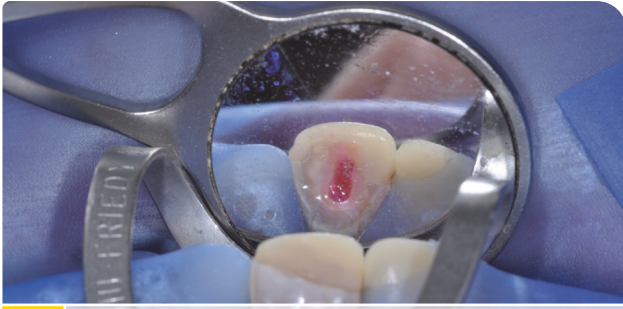
6 First, apply Bleach'n Smile internally.