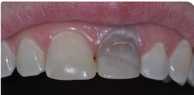
1+2 Polishing the tooth and anesthesia (1/100,000 Ubistesin).