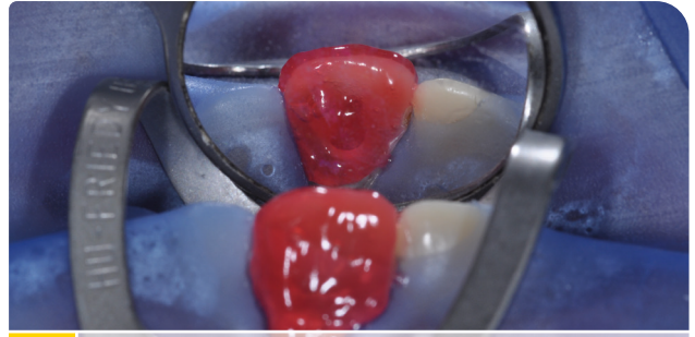
7 Next, apply Bleach'n Smile externally.