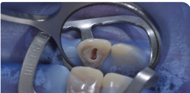
4 Access cavity from palatinal to crestal.